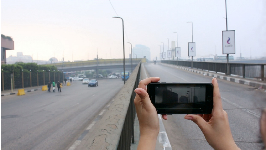
Figure 3. The Augmented Archive app, showing a video of the burning National Democratic Party building from January 2011, eight years later, after the building had been demolished.

“When looking at these videos,” activist Sharif Abdelkouddous of the Mosireen collective, says in an interview that is part of The Augmented Archive project,