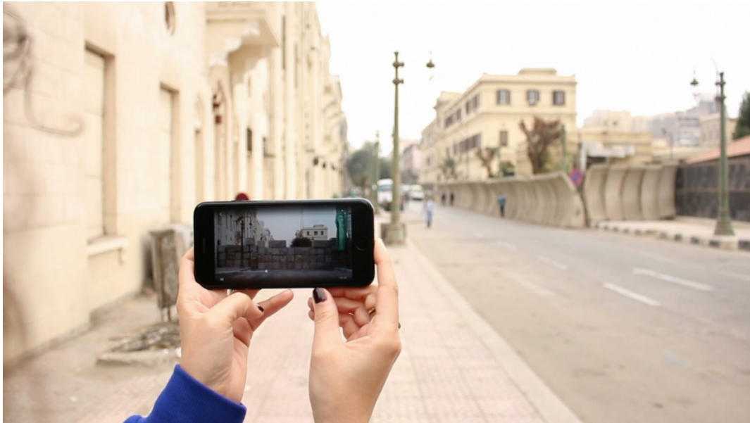
Figure 1. The Augmented Archive app in a street close to Cairo's Tahrir Square, showing a video of the same street six years earlier, with road blocks erected by the military.

Behkalam describes The Augmented Archive as